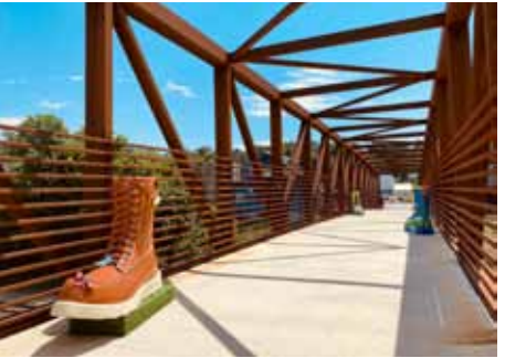
Boots on the Bridge