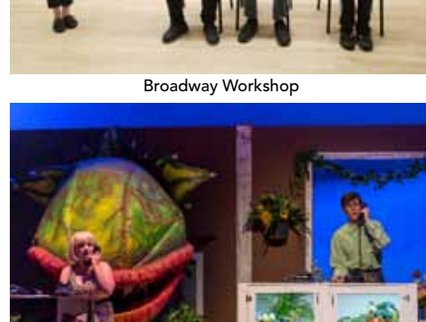
Little Shop of Horrors