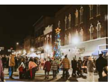
2022 Holiday Stroll