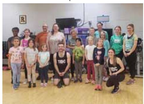
Trinity Irish Dance