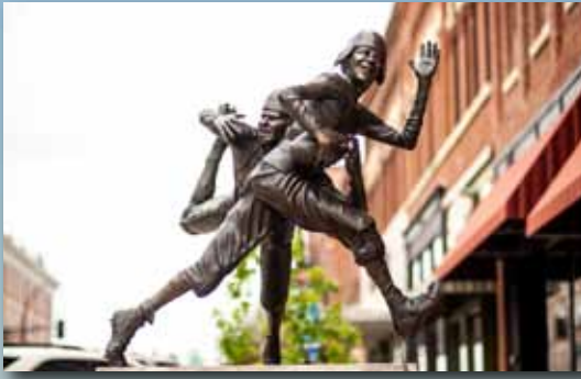
A grant was used to place nine sculptures in Downtown Red Wing.