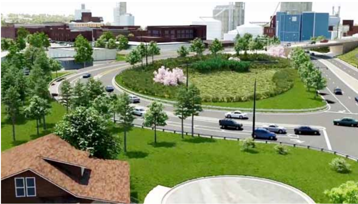
Artist's rendition of the landscaping leading onto the new Eisenhower Bridge of Valor. Red Wing Area Fund contributed $182,500 over four years for lighting, landscaping, and bridge aesthetics.